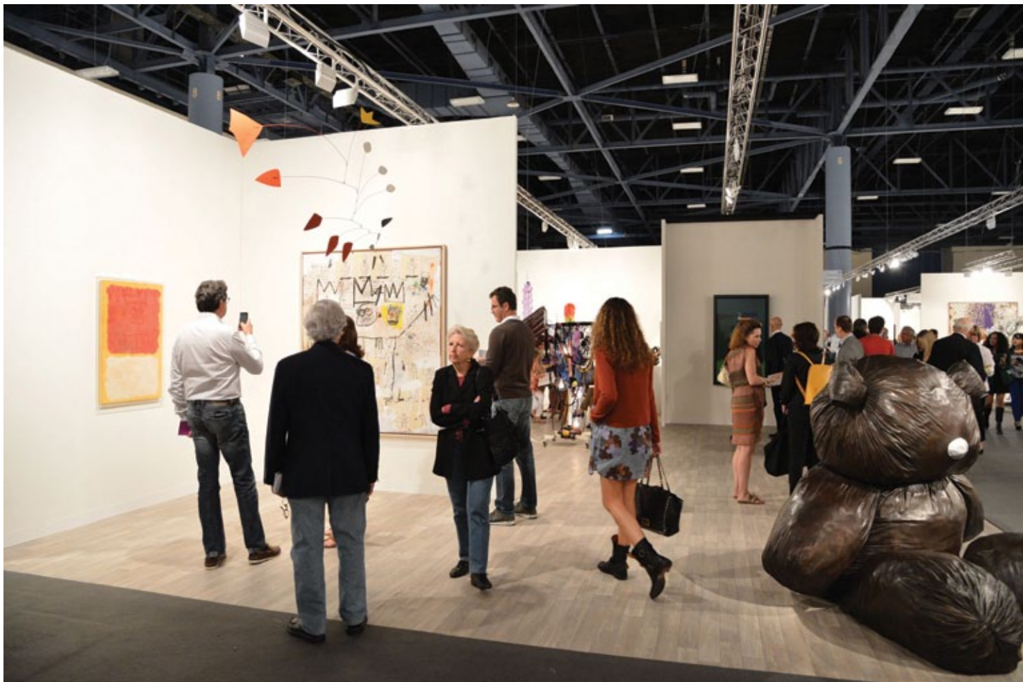
Kukje Gallery